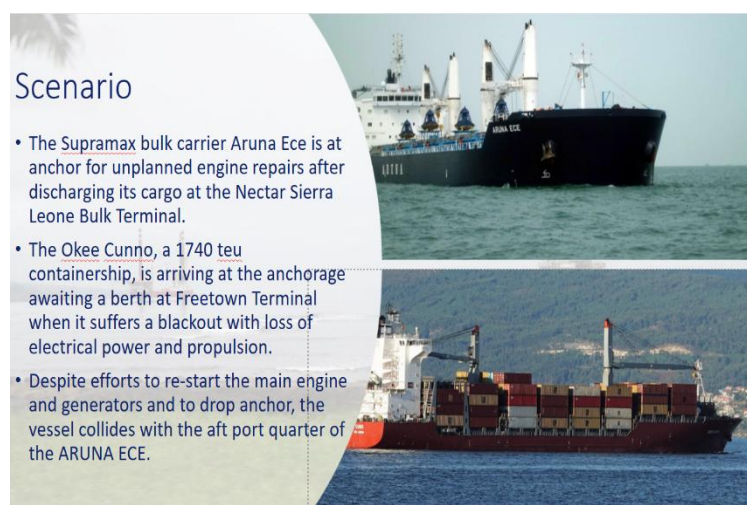
Figure 2 Sample PowerPoint slide setting the scenario

Spill information, injects and tasks were communicated to participants using PowerPoint slides. A credible scenario, using vessels that previously called in Freetown port, was developed including likely oil type and spill volumes. The scenario involved a vessel collision at the port anchorage.