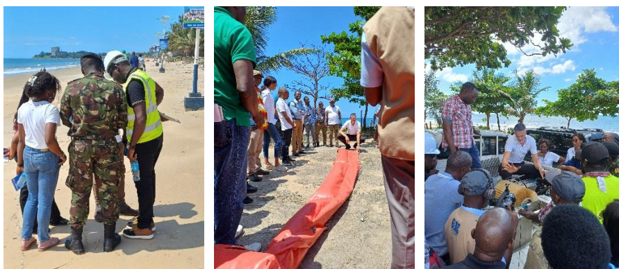
Figure 1 Shoreline survey practical, demonstration of tier 1 containment boom and recovery skimmer.

Content was delivered through a combination of PowerPoint presentations, interactive question and answer sessions and video recordings. The programme also included a practical exercise for participants to practice using standardised shoreline survey templates and a demonstration of a selection of Oryx Energies tier 1 response equipment.