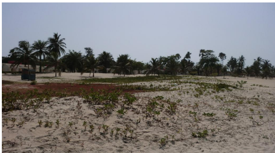
Figure 3. Areas 1 and 2. Backshore characteristics

The groups identified the main characteristics of the shoreline foreshore and backshore and the main site hazards. The groups had each drawn the site marking out the salient features such as access and annotated the drawing with suggested deployment zones, equipment lay-down areas, access and egress control points, decontamination and temporary storage areas.