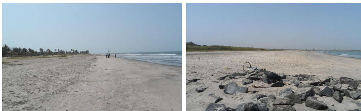
Figure 2. Area 2. Sandy Beach with scattered rock outcrops